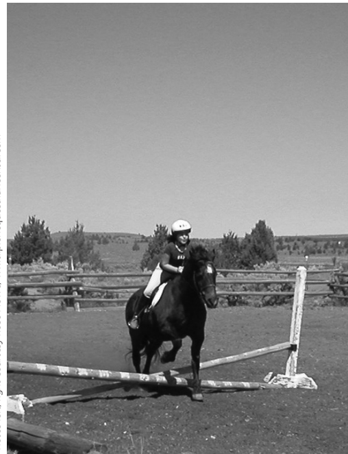
www.triplehequestriancenter.com